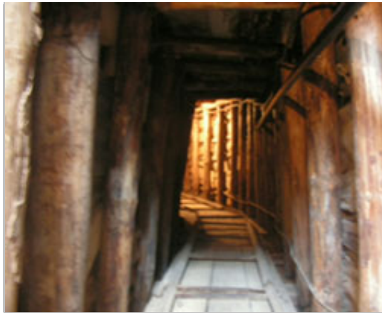
Tunnel dug underneath Sarajevo International Airport to transport goods and personnel in and out of the city

An island though it was, there was one strip of land connecting Sarajevo with the rest of Bosnian Muslim (Bosniak) territory. The UN had taken control of the airport early in the conflict, and they alone controlled passage in, out and through. There are reports that have surfaced that when a Sarajevoan would try to escape via running across the airfield, UN soldiers would train spotlights on them, allowing Serb snipers an easy target. The only things allowed to pass through the airport were UN personnel and humanitarian aid.