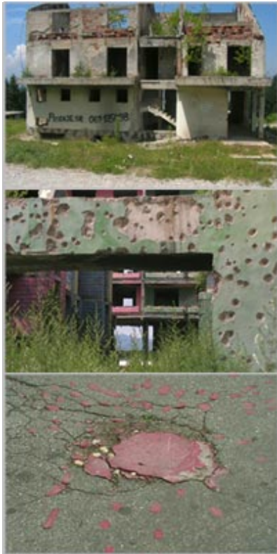
War-torn building, bullet damage, and bomb "sun" hole filled with red cement, known as a "Sarajevo Rose"

live in the city. Bosnia had a prewar population of about 4.5 million, but the war in the Former Yugoslavia killed an estimated 200,000 people. Today, Sarajevo exists in the midst of cemeteries with headstones extending for miles and miles. It's a beautiful city, nestled in a low valley with rolling hills on all sides. Sarajevo was a popular tourist city before the war. In fact, the 1984 Winter Olympics were held there, solidifying Bosnia's value to the west and declaring itself a part of Europe, not just a part of the Eastern European Bloc. Today, the Olympic headquarters is an empty shell, desolate and ominous. The Olympic Stadium became the largest cemetery in Bosnia.