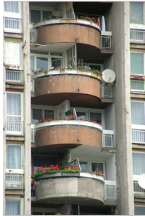
Communist era style apartment building