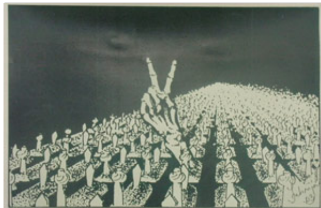
Poster: Srebrenica / Potocari / 2003

We left that structure and Kathleen spied the correct building. I went inside and found a line outside the lavatory, so I headed up the stairs to the next floor. The second floor had offices set up with phones, faxes and copiers. I wondered, "How far up can I go?" Two flights of stairs later, I was on the top floor, apparently alone. All of the offices were set up as conference rooms, bottles of water neatly arranged in the center of long tables. I used the empty lavatory there, and then ventured back down to explore the lower floors. The third floor was much the same as the fourth, but the second floor contained some interesting art. It was obvious that memorials here were common, as many of the prints on the wall had various dates. I snapped some photos, then left to get back to the more interesting sites.