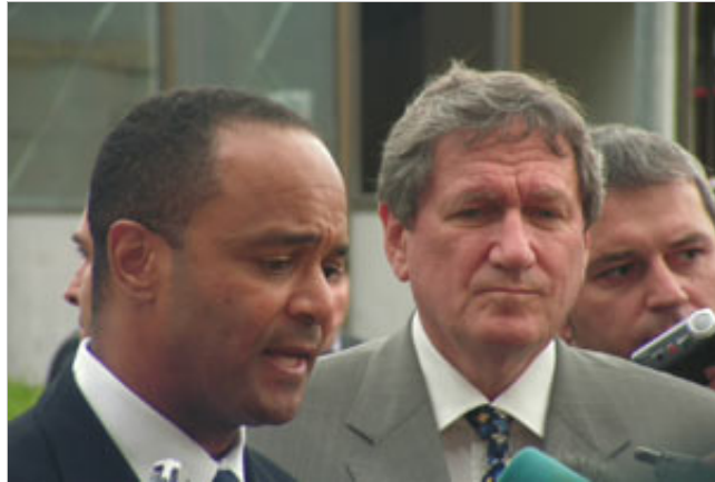
U.S. Ambassador-at-Large for War Crimes Pierre-Richard Prosper and former U.S. Ambassador to the United Nations Richard Holbrooke.

She stepped forward and asked Mr. Holbrooke if he felt it necessary to apologize for the way that the Dayton Peace Accords divided the country and legitimized the ethnic cleansing of what is now Republika Srpska. His face became contorted as he realized the gravity and personal implications of what she was asking, and he almost took a step back, trying to work out the least politically damaging response he could manage.