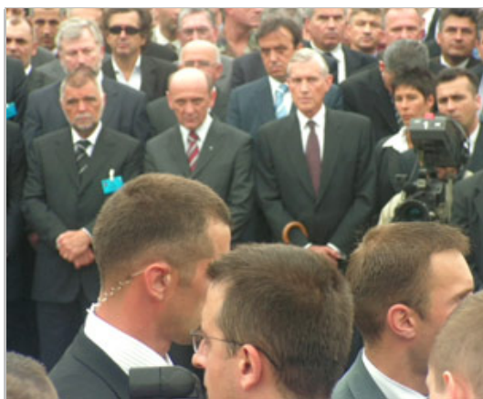
Security entourage for dignitaries in attendance

memorial without saying a single word to me. Their sinister stares were enough to keep my questions inside.