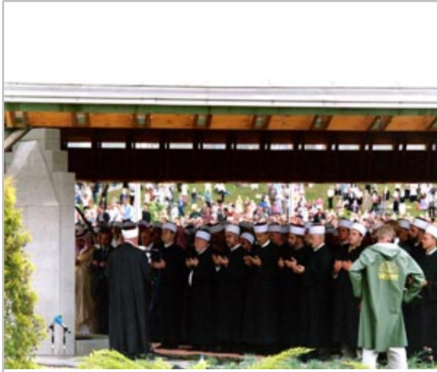
Imams from across the globe joined together in a benediction and prayer.