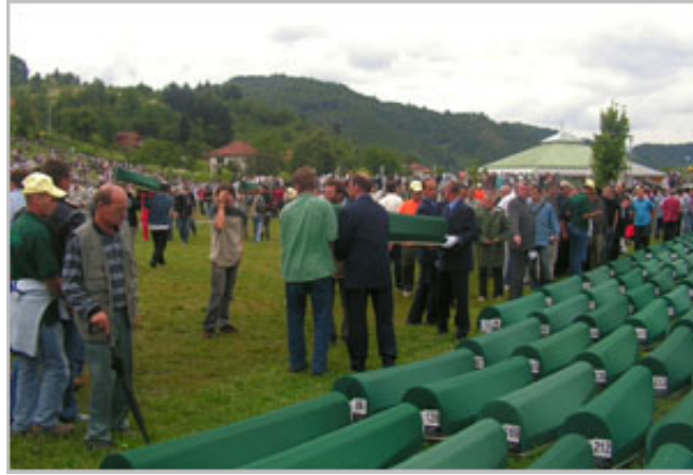
Coffins are passed one at a time through rows of volunteers.

The Turkish man offered to take a picture of me carrying the coffins, which I was extremely grateful for. In all my travels on this trip, those photos ended up being the majority of pictures documenting the fact that I was there. As we moved the coffins, I realized how incredibly fortunate I was to be there and to experience this event, not just visually and emotionally, but also physically. Carrying the coffins with my own hands, I was able to truly experience them in all their dimensions. Some, as one might expect, were heavy; the weight of a body clearly evident. Others were surprisingly light, as if they were nearly empty. This fact reminded me how little of a person might be recovered and identified due to unearthing and reburial, a process many mass graves in Bosnia endured.