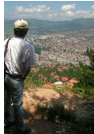
View of Sarajevo from hillside sniper post

kept me even more critical of what was said than I