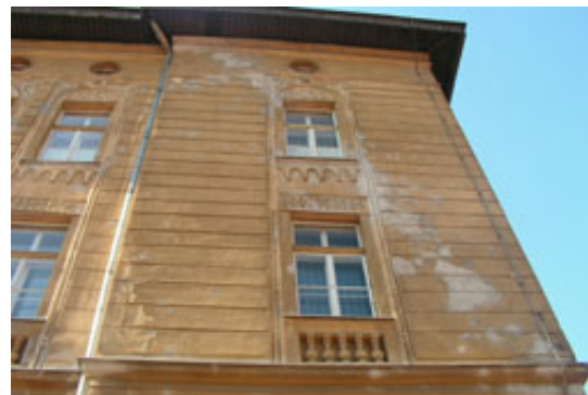
Government buildings still wear their scars

A troupe of charter buses met the conference participants