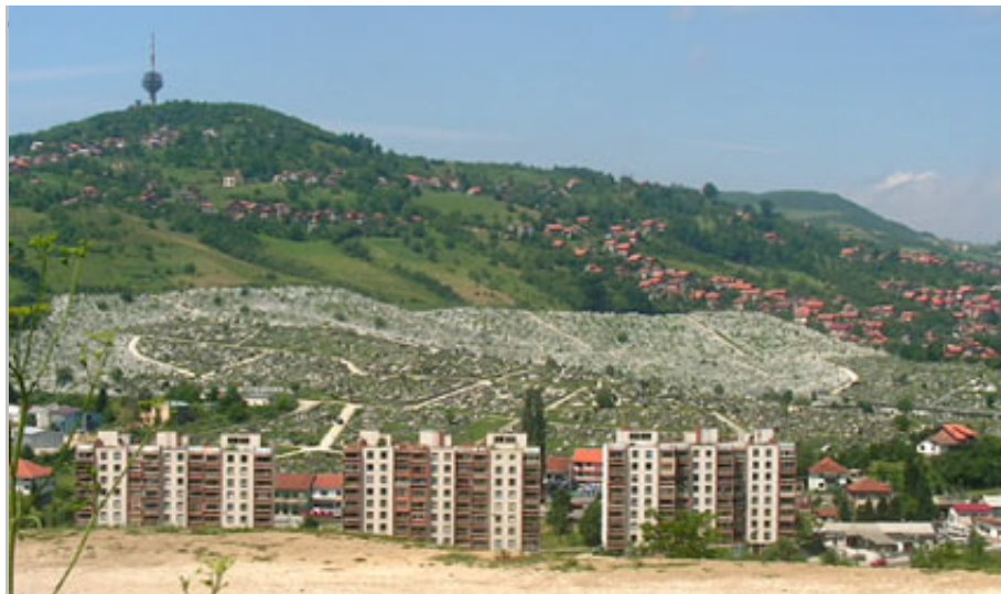
City of Sarajevo surrounded by cemeteries

The conference was housing all of the presenters there and was paying for accommodations for all the students in another hotel. This alone must have been quite a sum of money to pay, but on top of it, breakfast, lunch and dinner were provided for all conference participants five days in a row. This doesn't even include the materials given out (specifically the custom-made briefcases with full-color photograph books, notepads and pens inside), which seemed fairly pricey. This raised my suspicions and