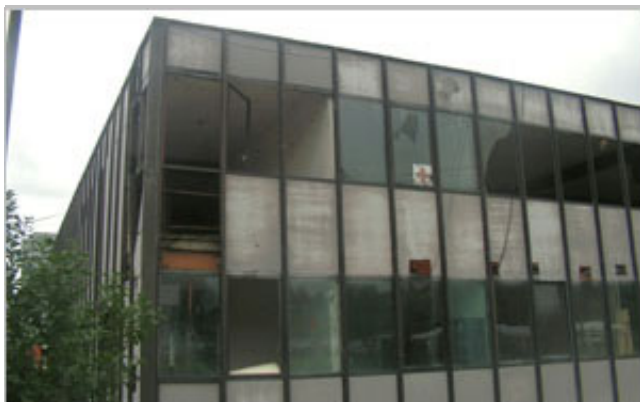
Abandoned UN headquarters at Srebrenica, previously a battery factory

In another, smaller room, I found a most curious painting. On the left side, a peaceful, scenic village lay on lush rolling hills. As one panned to the right, a woman came into view, lying naked on her side under the blue sky. She was lying in a pool of blood that ran away from her to the right and transfigured into a serpent head, fangs bared in the direction of the UN insignias.