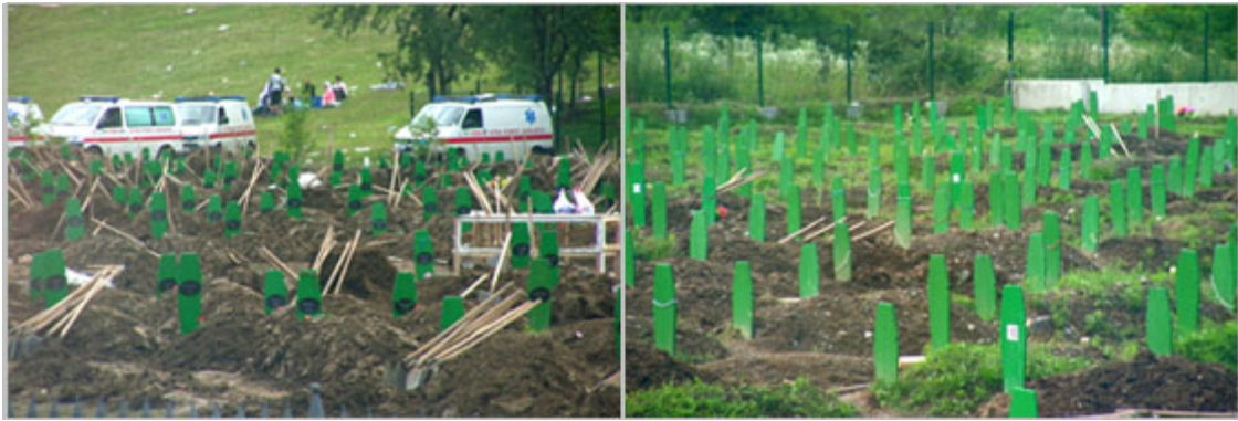
Finally at rest. In Muslim culture, burial is very important for the families of the deceased. Their families now have a precise location to pray and to grieve. Their long wait is over.