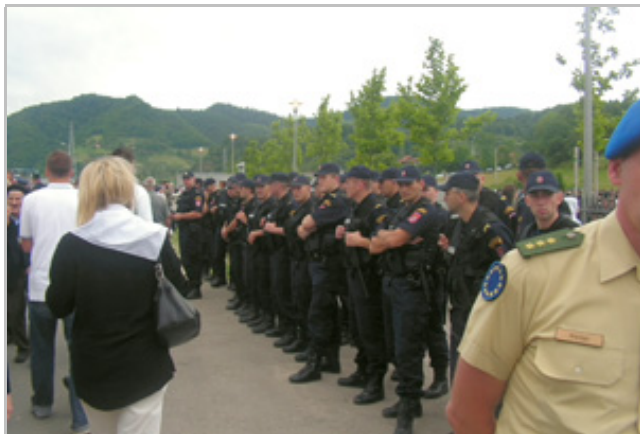
To enter the grounds, visitors had to walk past intimidating Republika Srpska Police decked out in their tactical gear.

We went from city to countryside instantly, passing only small residential centers. About three quarters of the way through the trip, we started noticing the security along the road and intersecting streets tighten. Police cars became regular sights on side roads and a policeman was stationed about every 200 meters along the shoulder. We had to pull over about a mile from the memorial center so that the bus could be searched. By the attitude of the officer and his half-hearted attempt to look under our seats, it was obvious he was doing this for our peace of mind rather than for our safety. It was at that point that our police escort began.