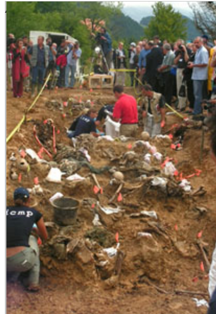
Mass grave with ICMP workers inside and visitors above