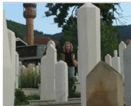
Dr. Young walking through a Muslim cemetery

"Muslims used a three foot tall white obelisk with a passage from the Quran inscribed underneath the deceased's name and dates of life. The top would be pointed if it were a woman's stone and rounded for a man...Only upon reflection later did I realize that the vast majority of these graves were the graves of women."