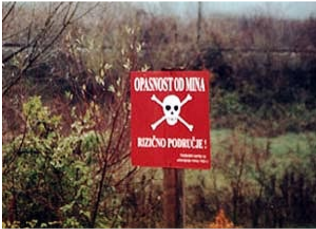
The Bosnian countryside is littered with landmines.

Tour", was done all by private car and took us through the entire city and up into the outlying areas of interest. This was yet another example for me of the "Hand of God", or whatever you want to call it, leading me during this excursion and helping me understand. Early the next morning, I was on my way to meet him, camera in hand.