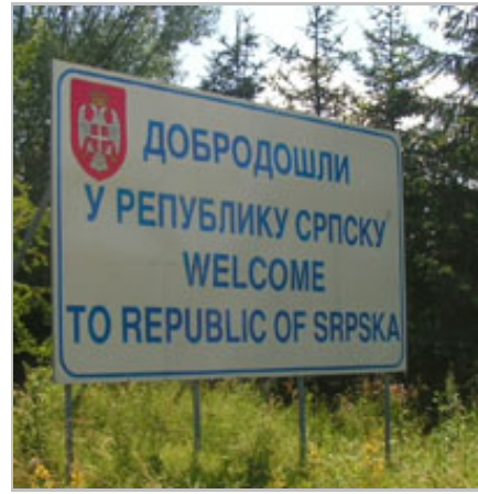
A Republika Srpska sign on the way to Srebrenica where multiple genocidal events occurred

Needless to say, we are not the most welcome visitors to this region of Bosnia which is still controlled by Serbs. In fact, just weeks before, police found multiple remote-detonation bombs planted at the memorial center we were enroute to. I knew the security detail would be massive. Nothing to fear, right?