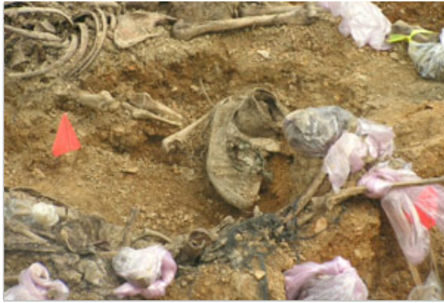
A mass grave excavation near Srebrenica