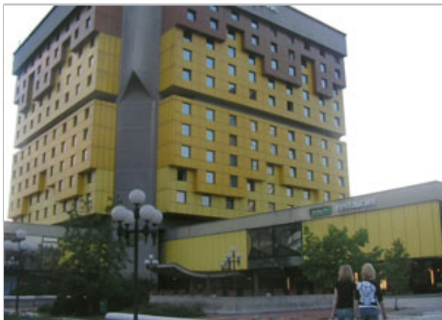
Sarajevo: Holiday Inn

kept me even more critical of what was said than I