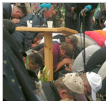
Muslim men praying at Srebrenica Memorial Ceremony

After the political speeches ended, imams from across the globe joined together in a benediction and prayer in both Bosnian and Arabic. Though I could understand nothing, it was very calming to listen to. I imagined talk of peace and love, both for the living as well as the dead. Afterwards, the Muslims in the audience joined the imams in their traditional prayer. All of a sudden, half of the people around me dropped to their knees in unison, eyes closed, palms facing the sky. It was at